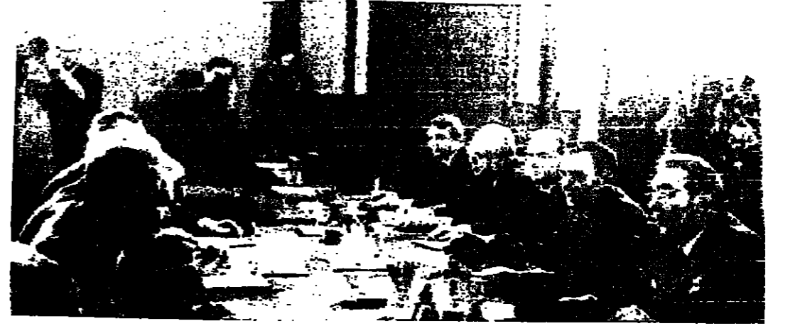
MOSCOW MEET -- Secretary General of the Soviet Communist Party Leonid Brezhnev (first from right) and Foreign Minister Andrei Gromyko (to Mr. Brezhnev's right) listen to U.S. Secretary of State Cyrus Vance (first from left) during talks at the Kremlin Monday.

AMMAN, March 28 (Agencies) Mr. Yasser Arafat, Chairman of the Palestine Liberation Organisation (PLO), arrived in Riyadh today on a visit to Saudi Arabia, Riyadh Radio reported. His visit follows agreement by the Arab League Council yesterday to renew the mandate of the 30,000-man Arab peace-keeping force in Lebanon for another six months. Mr. Arafat yesterday held separate talks in Cairo with Egyptian President Anwar Sadat and Egyptian Premier Mamdouh Salem. His talks with the Egyptian officials were understood to deal in part with the forthcoming visit to the United States by Mr. Sadat for talks with President Carter on ways of solving the Middle East problem.